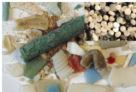
Figure 1. An example of plastic debris collected from Maha'ulepu Beach, Kauai, HI. Inset: Pellets collected from Canatara Beach, Sarnia, ON, Canada.

total reflection (ATR) objective on the microscope attachment of a Bruker IFS55 FTIR. FTIR analyses showed that all these samples have significant oxidation of their outer surfaces. Only samples that were relatively free from adsorbed silicates or carbonate materials were used for TOF-SIMS analyses.